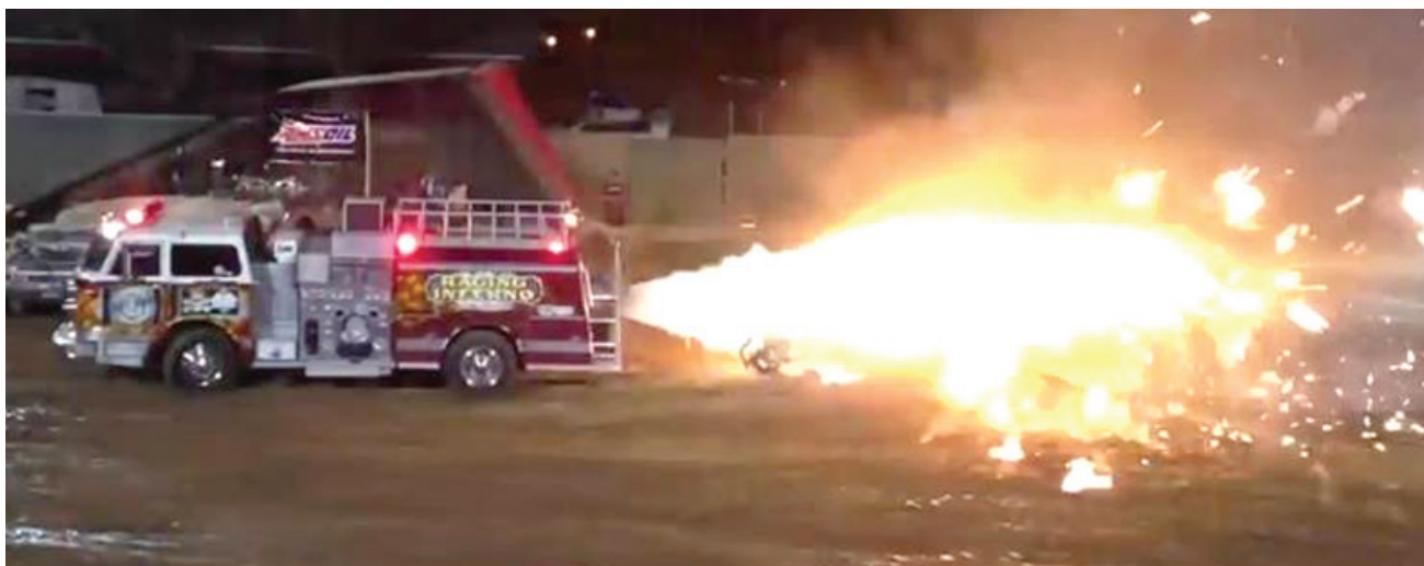
Spectators can enjoy an awesome jet fire, meltdown and smoke show—the wild jet powered fire truck—the Raging Inferno!