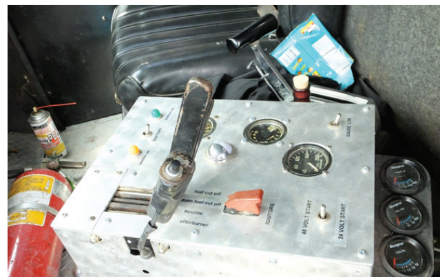
Between the front seats in the Raging Inferno, are the panel and controls that maneuver the Inferno's actions.